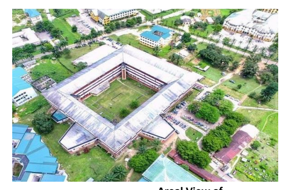
Areal View of University of Port Harcourt, Nigeria

The PASET Regional Scholarship and Innovation Fund