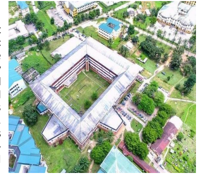
Areal View of University of Port Harcourt, Nigeria

The Mission of the University of Port Harcourt is the pursuit of academic excellence, advancement of knowledge and community service through quality teaching, life-long learning, social inclusion, strengthening civil society and policy-relevant research that addresses the challenges of contemporary society. To achieve this Mission, the University is guided by the spirit of enquiry, self-reliance, fairness, ethical and professional standards of the disciplines.