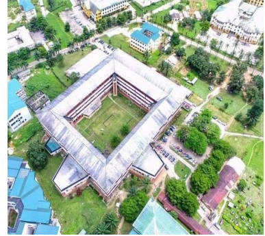
Areal View of University of Port Harcourt, Nigeria

The Mission of the University of Port Harcourt is the pursuit of academic excellence, advancement of knowledge and community service through quality teaching, life-long learning, social inclusion, strengthening civil society and policy-relevant research that addresses the challenges of contemporary society. To achieve this Mission, the University is guided by the spirit of enquiry, self-reliance, fairness, ethical and professional standards of the disciplines.