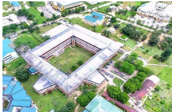
Areal View of University of Port Harcourt, Nigeria

The PASET Regional Scholarship and Innovation Fund